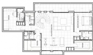
PRELIMINARY LOWER GROUND FLOOR